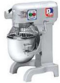
Planetary Mixer PLM 10