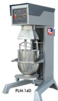
Planetary Mixer PLM 140