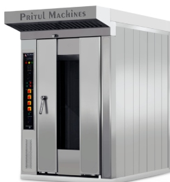
Industrial Oven Model 786 NH