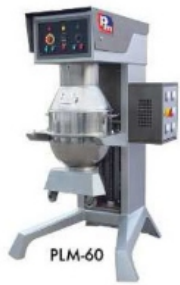
Planetary Mixer PLM 60