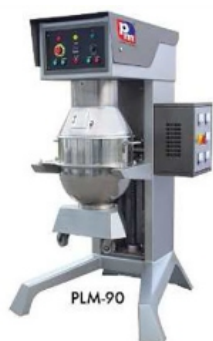
Planetary Mixer PLM 90