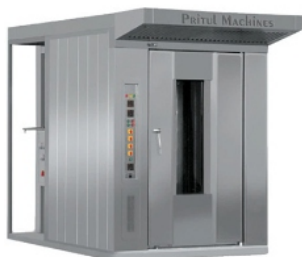
1350 Single Trolley Bakery Bread Oven