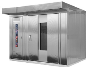
Stainless Steel Industrial Oven Model 1825PT