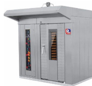
660NH Industrial Bakery Oven