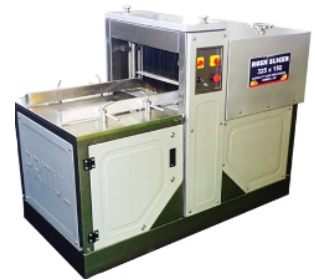
13 Inch Medium Speed Bread Slicer