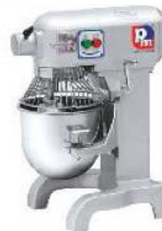
Planetary Mixer PLM 20