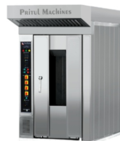
Industrial Oven Model 786FH