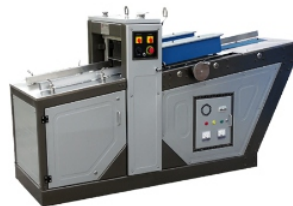
13 Inch High Speed Bread Slicer