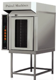
Stainless Steel 560 Industrial Oven With Proffer