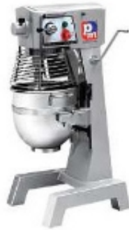
Planetary Mixer PLM 30